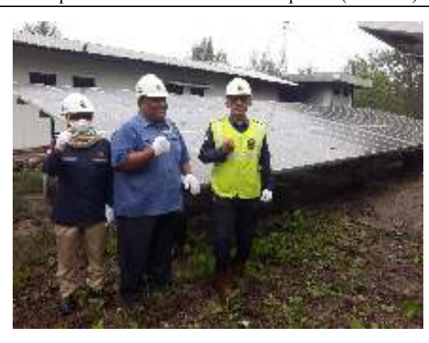
Fig. 4. Field Observation of PLTS 25 kWp Off Grid of Tunda Island