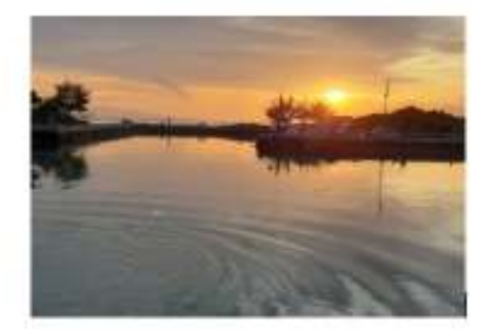
Fig. 1. The Enchanting Island of Tunda