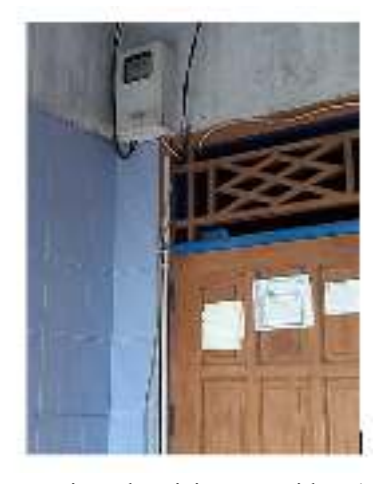
Fig. 6. Cluster and Limiter Systems for Connecting Electricity to Residents' Houses

The current condition is that there is only one technical personnel who handle of the generation of both PLTS and generators, operation, maintenance and trouble related to electricity in each resident's house. So that one technical personnel must be ready at any time to be called by residents if there is a power outage at residents' houses, mcb step down or outage at residents' houses if residents use electricity exceeds from the predetermined limiter. One other technical personnel only occasionally helps because he has other permanent jobs or profession. Besides technical personnel there is also 1 (one) administration staff related to the administration, whose job is collecting and recording of payment residents' electricity usage. Electricity payment are made and collected every 7 (seven) days. The duties and job description of technical personnel who handle the electricity on Tunda Island day to day operation as follow in Table 3.